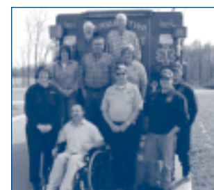
Jacob's Village staff members were certified in CPR/First Aid by the German Township Fire & Rescue Department on February 25. The training was interrupted only once for an emergency rescue call. Fortunately, the Fire & Rescue squad made it back in time for a well-deserved lunch!