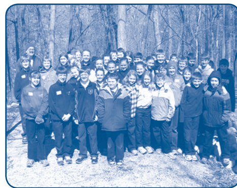
Good Shepherd fifth-grade students on the JV Nature Trail.

A good time is always had by all. We have built up strong and reciprocating partnerships with schools and we are very blessed to